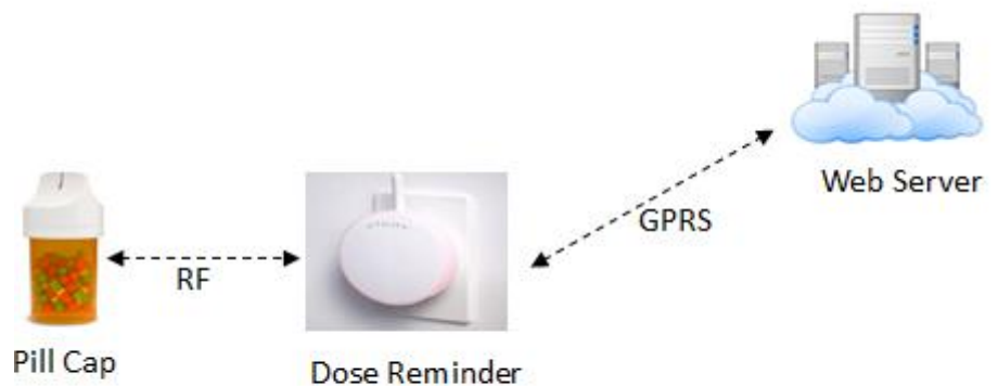
Fig: Solution overview